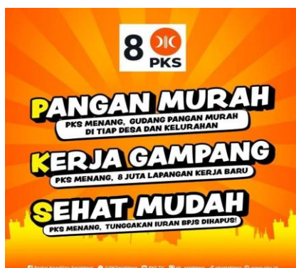
Figure 6. PKS slogans in the 2024 elections

The PKS's endorsement of Anies Baswedan for president enhances the party's standing among contemporary Islamic voters and organizations advocating for policy reforms. Younger people and metropolitan voters who are generally skeptical of the present administration find Anies particularly appealing. Because of this, the PKS is better able to rally support from a larger portion of the population (Safira,2024) [23]. The "Anies Effect" brings electoral benefits to the PKS in the 2024 election by increasing electability, mobilizing the mass base, and strengthening cadre loyalty. However, challenges in political competition, resistance from other groups, and the dynamics of identity politics must be anticipated so that this strategy provides maximum results for the PKS.